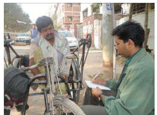
Filling up survey form on the street