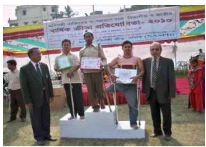
Children with Disabilities receiving prize at National Sports

: The "Child laborer with Disabilities in urban informal sector" is living in the mainstream society with equal access to functioning child protection system that effectively prevent, address and respond against abuse, discrimination, exploitation and violence against children by the year 2018.