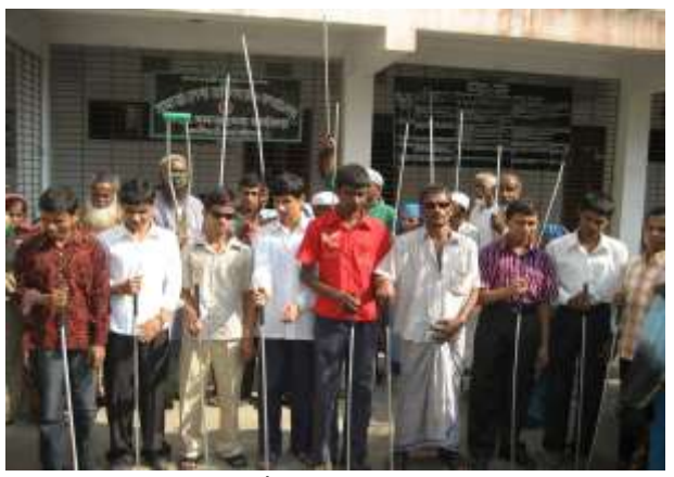
White cane support