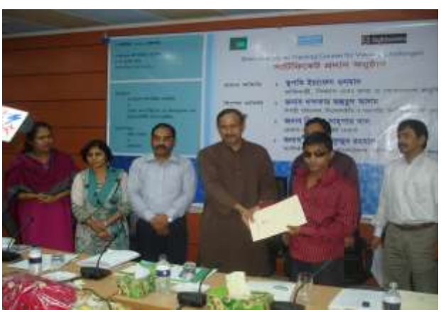
Computer training at BCC & Certificate distribution ceremony