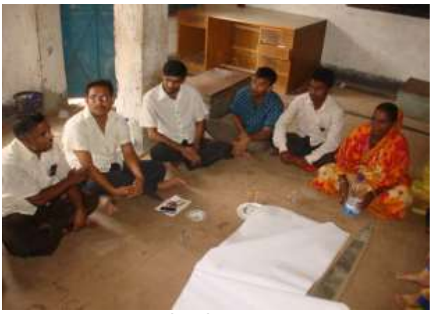
Vocational skill training (Mobile Servicing)