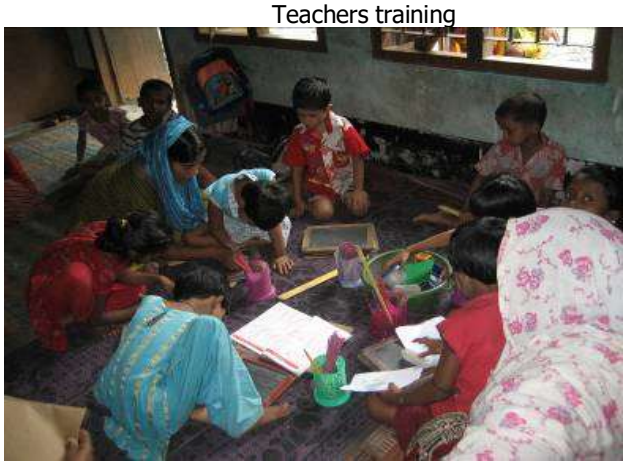
Project running Pre School