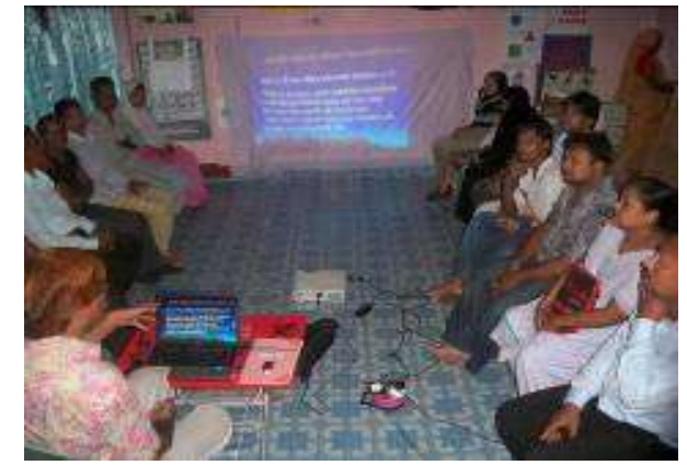
Meeting with CDDC members