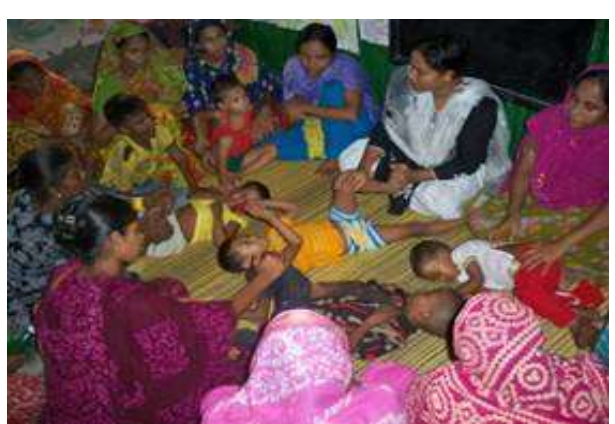
Primary Care Orientation