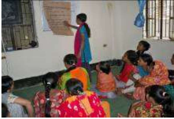
Regular group meeting