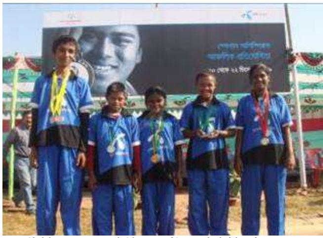
Children in special Olympic (Special children)

society with equal rights, opportunities and dignity.