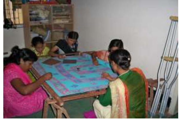
Vocational skill training & Income generating activities