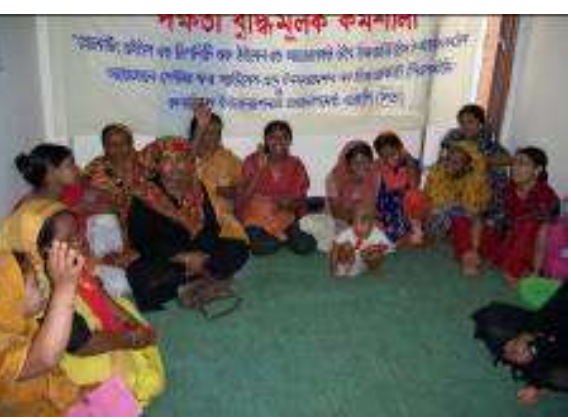
Capacity building workshop