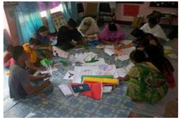
Workshop on Preparing Teaching Materials

rights, dignity and free from discrimination.