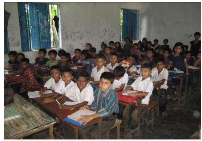
প্রাথমিক বিদ্যান শক্ষকদের প্রশিক্ষক বিষয়ে স্থানিক বাদ্যান কর্মনার্থনিক বাদ্যান বিষয়ে বিশ্বস্থান্তির বাশ্যান্ত্র বাদ্যান্ত্র বাদ্যান্ত্র বাদ্যান্ত্র বাদ্যান্ত্র বাদ্যান্ত্র বাদ্যান্ত্র বাদ্যান্ত্র বাদ্যান্ত্র বাদ্যান্ত্র বাদ্যান্ত্র বাদ্যান্ত্র বাদ্যান্ত্র বাদ্যান্ত্র বাদ্যান্ত্র বাদ্যান্ত্র বাদ্যান্ত্র বাদ্যান্ত্র বাদ্যান্ত্র বাদ্যান্ত্র বাদ্যান্ত্র বাদ্যান্ত্র বাদ্যান্ত্র বাদ্যান্ত্র বাদ্যান্ত্র বাদ্যান্ত্র বাদ্যান্ত্র বাদ্যান্ত্র বাদ্যান্ত্র বাদ্যান্ত্র বাদ্যান্ত্র বাদ্যান্ত্র বাদ্যান্ত্র বাদ্যান্ত্র বাদ্যান্ত্র বাদ্যান্ত্র বাদ্যান্ত্র বাদ্যান্ত্র বাদ্যান্ত্র বাদ্যান্ত্র বাদ্যান্ত্র বাদ্যান্ত্র বাদ্যান্ত্র বাদ্যান্ত্র বাদ্যান্ত্র বাদ্যান্ত্র বাদ্যান্ত্র বাদ্যান্ত্র বাদ্যান্ত্র বাদ্যান্ত্র বাদ্যান্ত্র বাদ্যান্ত্র বাদ্যান্ত্র বাদ্যান্ত্র বাদ্যান্ত্র বাদ্যান্ত্র বাদ্যান্ত্র বাদ্যান্ত্র বাদ্যান্ত্র বাদ্যান্ত্র বাদ্যান্ত্র বাদ্যান্ত্র বাদ্যান্ত্র বাদ্যান্ত্র বাদ্যান্ত্র বাদ্যান্ত্র বাদ্যান্ত্র বাদ্যান্ত্র বাদ্যান্ত্র বাদ্যান্ত্র বাদ্যান্ত্র বাদ্যান্ত্র বাদ্যান্ত্র বাদ্যান্ত্র বাদ্যান্ত্র বাদ্যান্ত্র বাদ্যান্ত্র বাদ্যান্ত্র বাদ্যান্ত্র বাদ্যান্ত্র বাদ্যান্ত্র বাদ্যান্ত্র বাদ্যান্ত্র বাদ্যান্ত্র বাদ্যান্ত্র বাদ্যান্ত্র বাদ্যান্ত্র বাদ্যান্ত্র বাদ্যান্ত্র বাদ্যান্ত্র বাদ্যান্ত্র বাদ্যান্ত্র বাদ্যান্ত্র বাদ্যান্ত্র বাদ্যান্ত্র বাদ্যান্ত্র বাদ্যান্ত্র বাদ্যান্ত্র বাদ্যান্ত্র বাদ্যান্ত্র বাদ্যান্ত্র বাদ্যান্ত্র বাদ্যান্ত্র বাদ্যান্ত্র বাদ্যান্ত্র বাদ্যান্ত্র বাদ্যান্ত্র বাদ্যান্ত্র বাদ্যান্ত্র বাদ্যান্ত্র বাদ্যান্ত্র বাদ্যান্ত্র বাদ্যান্ত্র বাদ্যান্ত্র বাদ্যান্ত্র বাদ্যান্ত্র বাদ্যান্ত্র বাদ্যান্ত্র বাদ্যান্ত্র বাদ্যান্ত্র বাদ্যান্ত্র বাদ্যান্ত্র বাদ্যান্ত্র বাদ্যান্ত্র বাদ্যান্ত্র বাদ্যান্ত্র বাদ্যান্ত্র বাদ্যান্ত্র বাদ্যান্ত্র বাদ্যান্ত্র বাদ্যান্ত্র বাদ্যান্ত্র বাদ্যান্ত্র বাদ্যান্ত্র বাদ্যান্ত্র বাদ্যান্ত্র বাদ্যান্ত্র বাদ্যান্ত্র বাদ্যান্ত্র বাদ্যান্ত্র বাদ্যান্ত্র বাদ্যান্ত্র বাদ্যান্ত্র বাদ্যান্ত্র বাদ্যান্ত্র বাদ্যান্ত্র বাদ্যান্ত্র বাদ্যান্ত্র বাদ্যান্ত্র বাদ্যান্ত্র বাদ্যান্ত্র বাদ্যান্ত্র বাদ্যান্ত্র বাদ্যান্ত্র বাদ্যান্ত্র বাদ্যান্ত্র বাদ্যান্ত্র বাদ্যান্ত্র বাদ্যান্ত্র বাদ্যান্ত্র বাদ্যান্ত্র বাদ্যান্ত্র

Goal: "Promoting education rights and inclusion of children with disabilities in to mainstream education system increased" and "An inclusive Employment Environment is created for Persons with Disabilities".