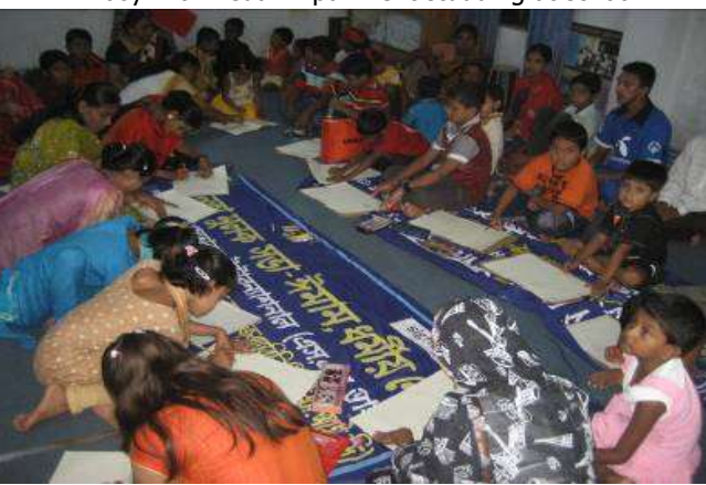
Art competition on the occasion of Child Rights Week