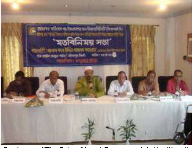
Seminar on "The Role of Local Government Authorities, the Political leaders, Councilors and Mayor" in promoting rights of CWDs