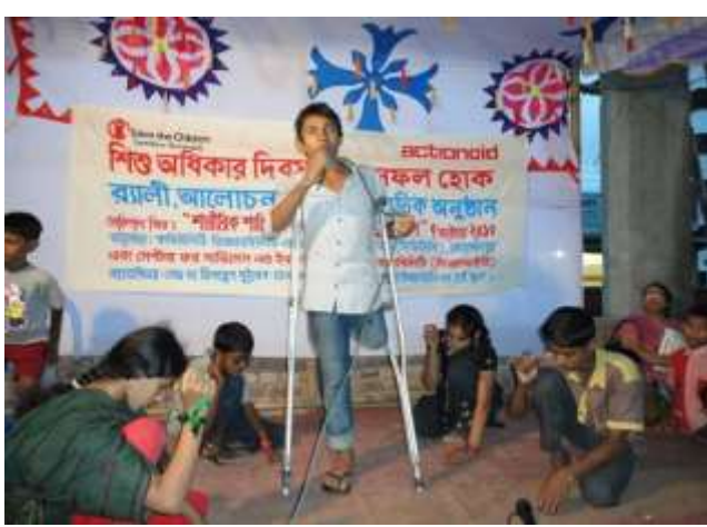
Children performing drama