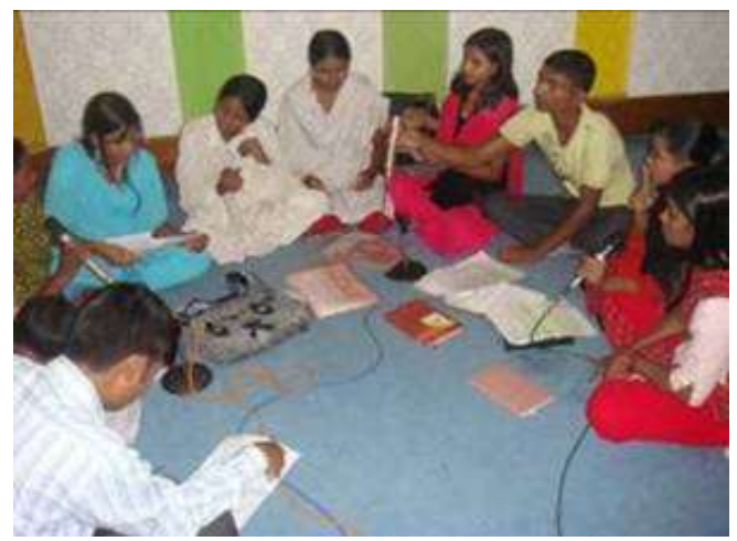
Cultural Group members in Regional Beter,