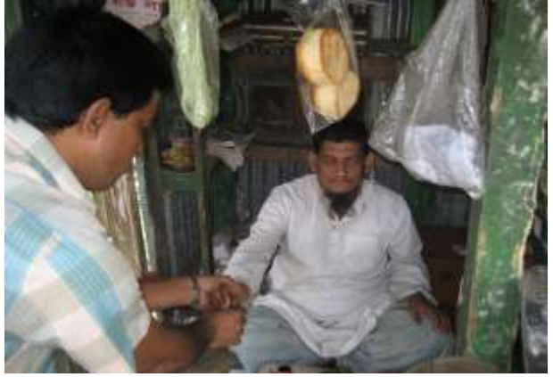
ADL mobility support