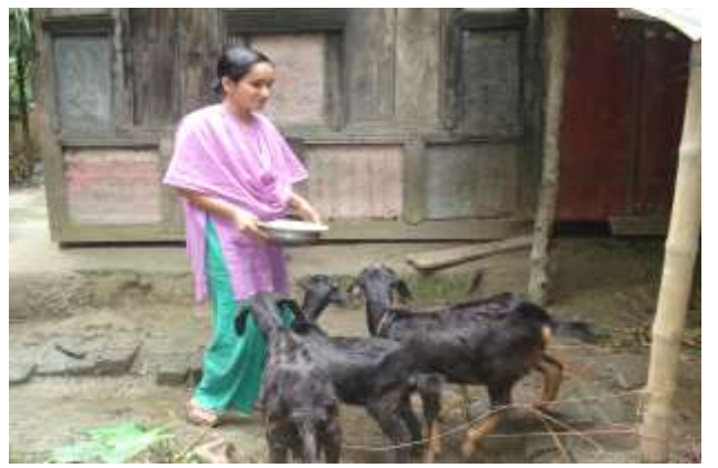
Income Generating Activities