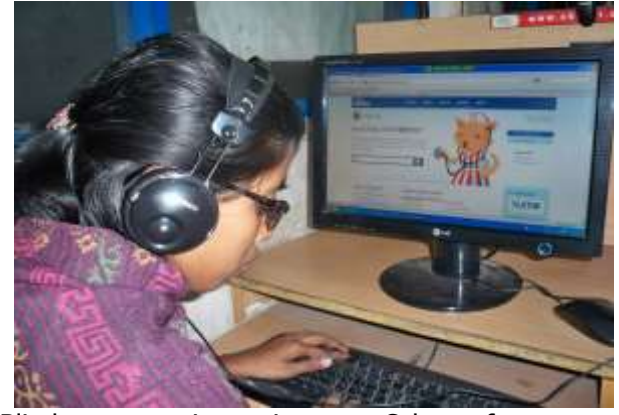
Blind persons using mainstream Cyber cafe