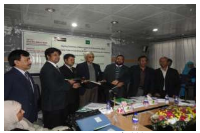
MoU sign with CCOAB